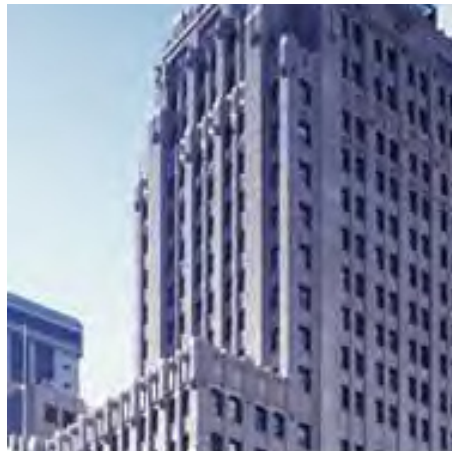
WASHINGTON ATHLETIC CLUB Seattle, WA

5-star Platinum Club with Private Membership facilities; including, dining venues, 110-room hotel, spa, catering, and athletic facilities.