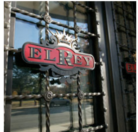
EL REY EXECUTIVE MEN'S CLUB Austin, TX

The only executive club in Austin targeting the male market, and one of the few in the world designed especially for men.